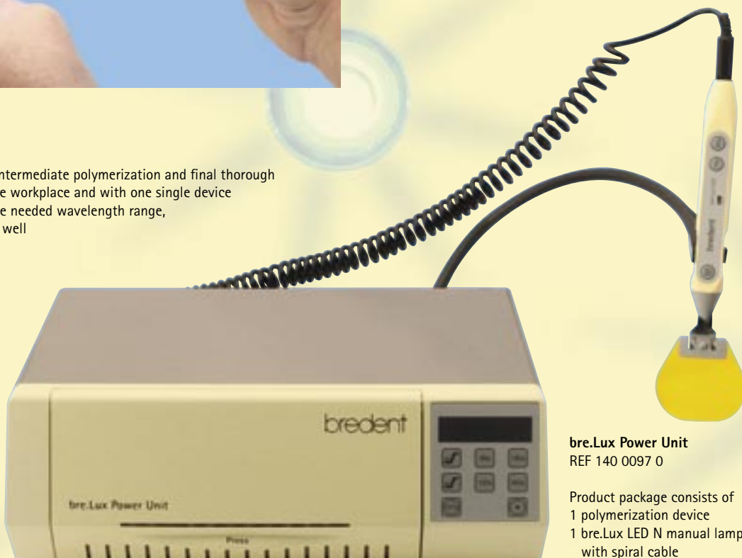
bre.Lux Power Unit REF 140 0097 0

Product package consists of 1 polymerization device 1 bre.Lux LED N manual lamp with spiral cable 1 bre.Lux UpDown 1 flexible hose 1 mains cable